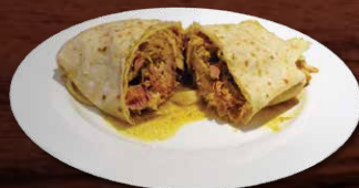
Curry Chicken Roti