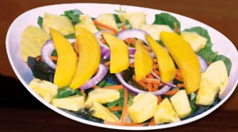
Mango Pineapple Salad